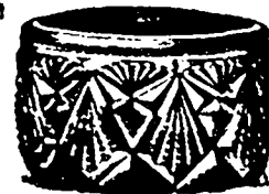
The Brown Bros., Limited

This firm have also just received from France a line of finer goods, such as