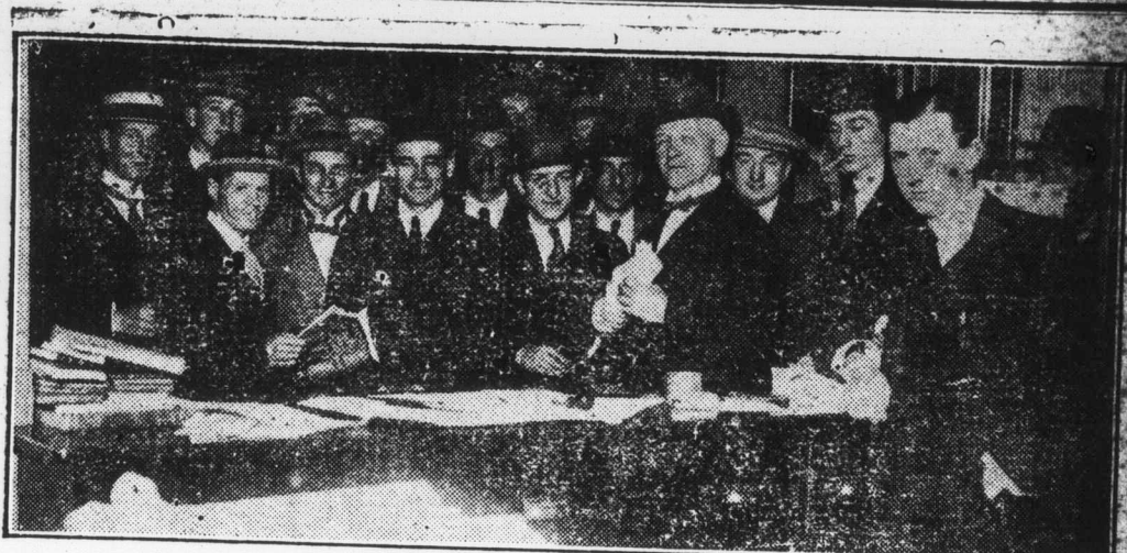
EAGER TO COME TO CANADA

This photograph was taken at the European head office of the Canadian Pacific Railway in London, England, and shows a number of men who were induced by the special harvesters rate to make further enquiries with regard to the scheme and conditions to be expected here after the harvest. Nearly the Canadian Pacific, and lack of steamship accommodation necessitated the closing of the doors against almost as many more.