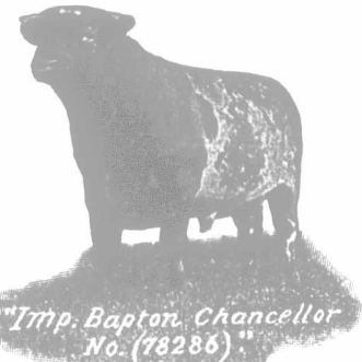
"Imp. Bapton, Chancellor No. 78286"