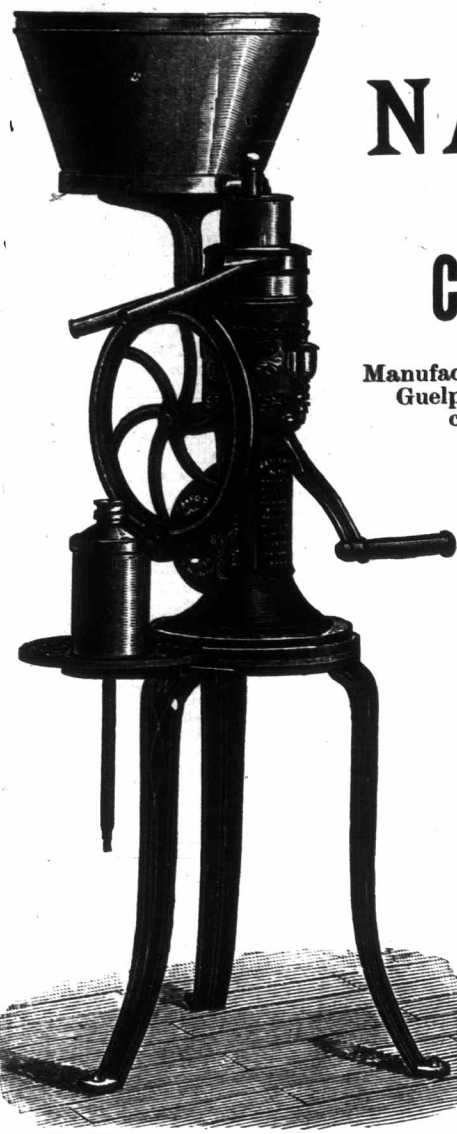
"NATIONAL" NO. 1 HAND POWER. Capacity, 330 to 350 lbs. per hour.

Write us before selling your wool. It will pay you. om