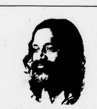
Maharishi Mahesh Yogi.

You may make your own room reservations by calling or writing to: Toronto-Downtown Holiday Inn, 89 Chestnut St., Toronto, Ontario M5E 1R1. Phone (416) 367-0707. (The Holiday Inn is located next to City Hall).