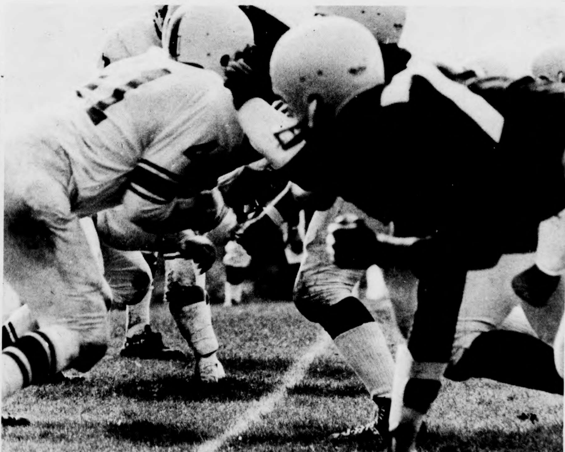
● Kill, Kill, Kill!!!