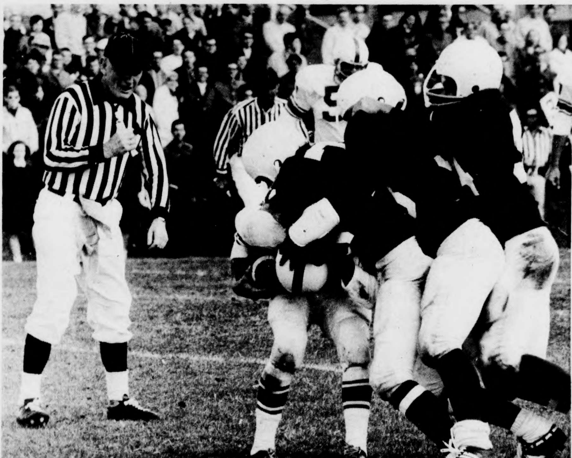
● Three to one odds, that's fair!?