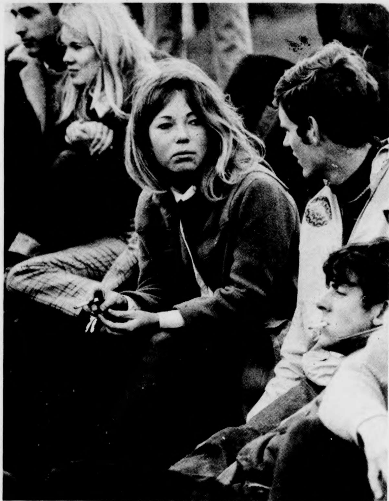
● A girl, what game?