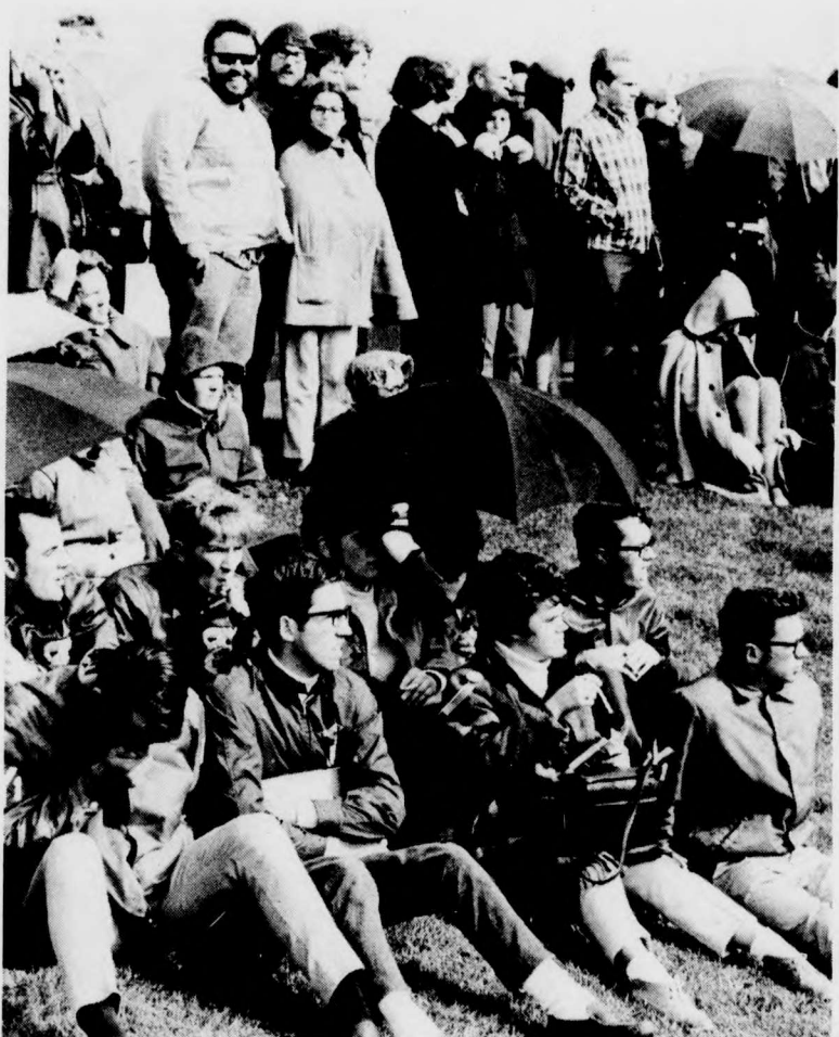
● A nice shot of the crowd.

Cheering squads from the Stamp Club gave ample, if not a little too much aid to the regular York girls. The girls refused to do cartwheels, though they were urged on by the flocks of horny male spectators.