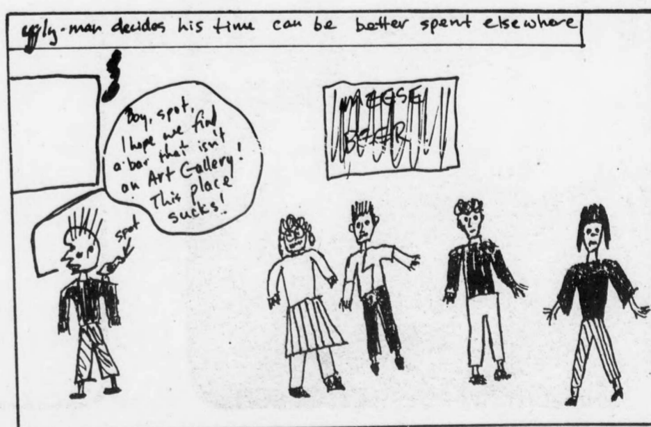
Ugly-man decides his time can be better spent elsewhere

you may not think Ugly-Man's actions are Heroic, but Jerry Falwell and the Women's Christian Temperance Union (WCTU) Certainly Do !!