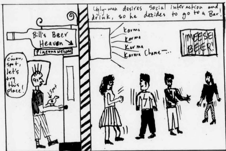
Ugly-man desires social interaction and drink, so he decides to go to a Bar.