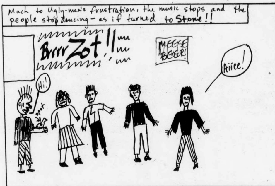
Much to Ugly-man's frustration, the music stops and the people stop dancing - as if turned to Stone!!