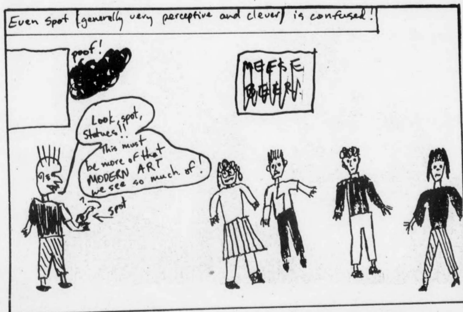
Even Spot (generally very perceptive and clever) is confused!