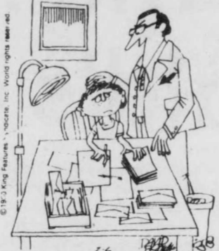
"You can stay up 'til ten tonight, but only because you're doing the taxes."