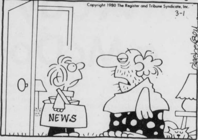
"No, I haven't joined a punk rock band. I always look this way in the morning."