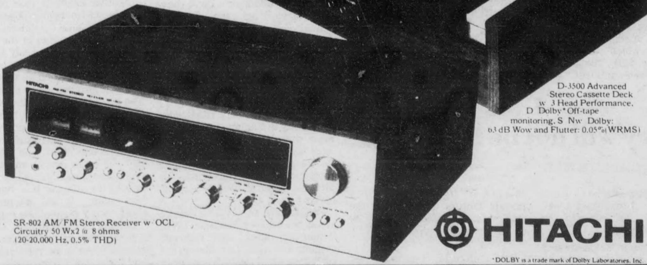
SR-802 AM/FM Stereo Receiver w/ OCL Circuitry 50 Wx2 @ 8 ohms (20-20,000 Hz, 0.5% THD)

The kind of achievement that has made Hitachi a world leader in electronics.