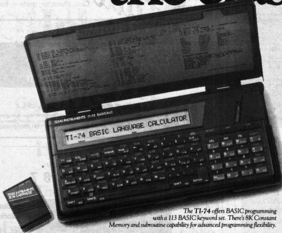
The TI-74 offers BASIC programming with a 113 BASIC keyword set. There's 8K Constant Memory and subroutine capability for advanced programming flexibility.