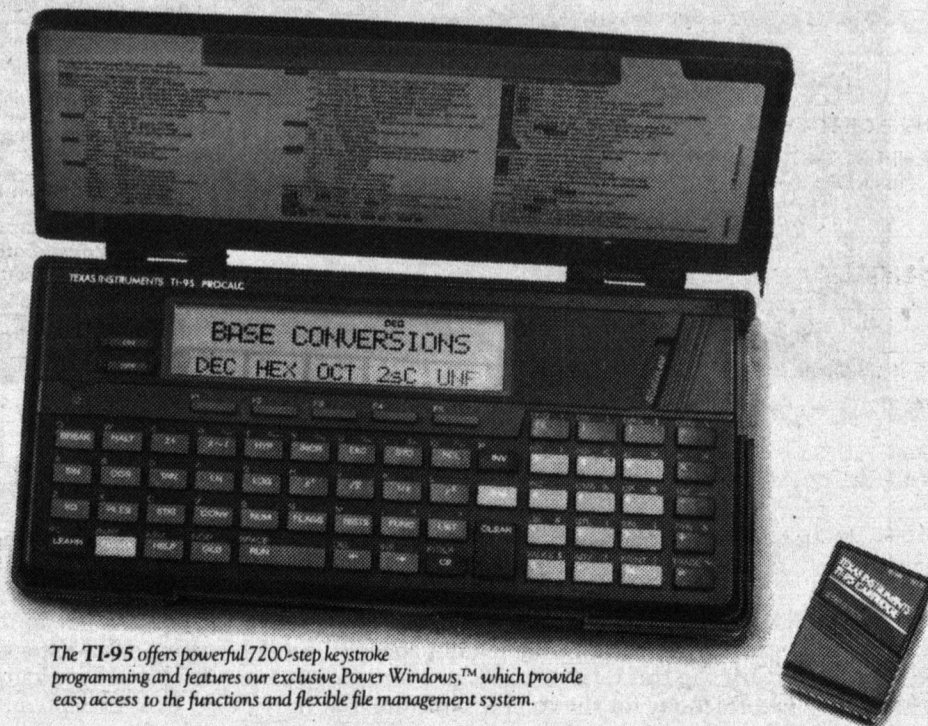
The TI-95 offers powerful 7200-step keystroke programming and features our exclusive Power Windows,™ which provide easy access to the functions and flexible file management system.

TI programmable calculators have all the right functions and enough extra features to satisfy your thirst for power.