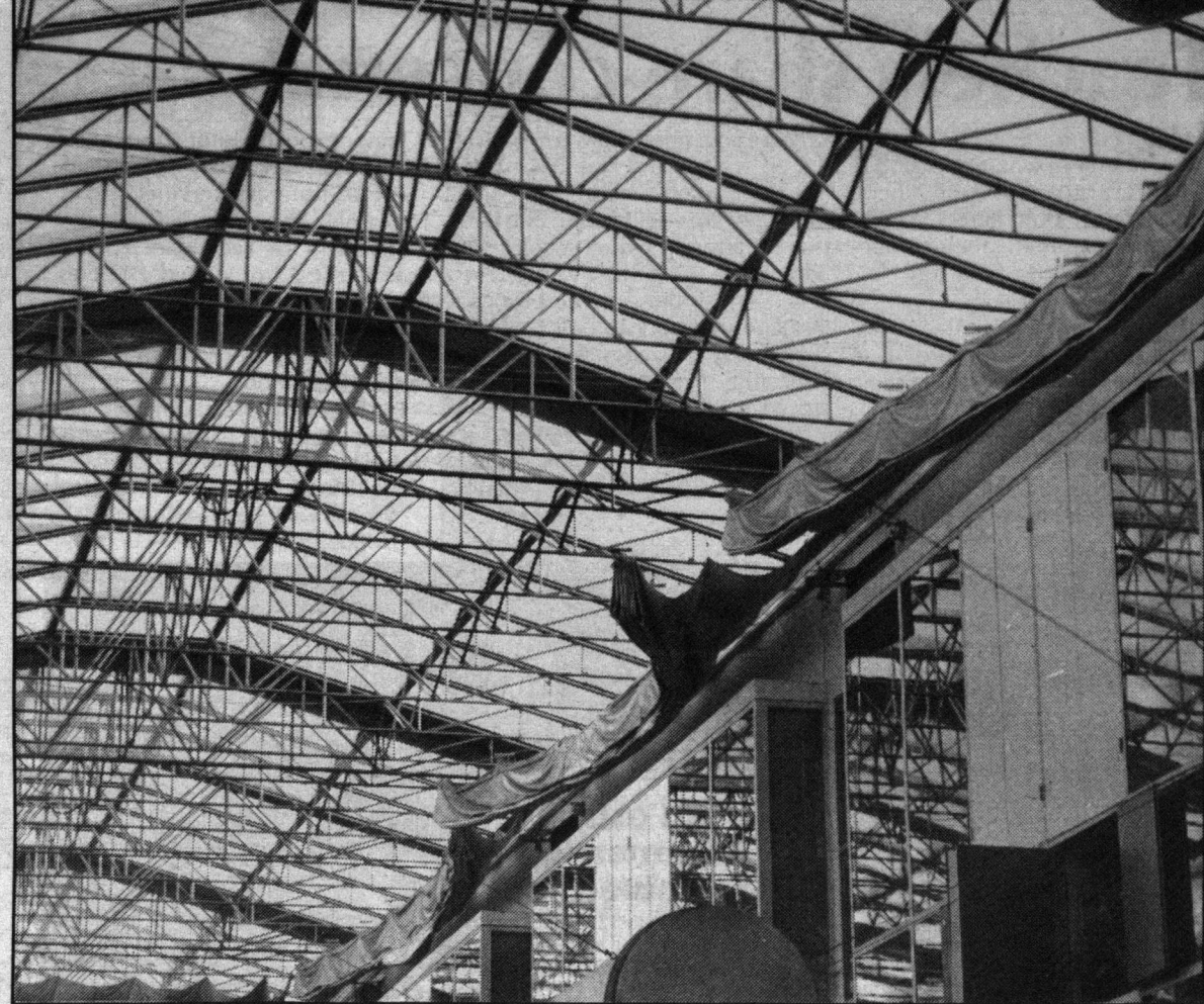
the repairs can be a one-shot or Until the university repairs HUB roof, carry an umbrella

"The university takes the attitude that if there is a problem it must be addressed," said Rennie. "The problem is to decide if if they must be phased in."