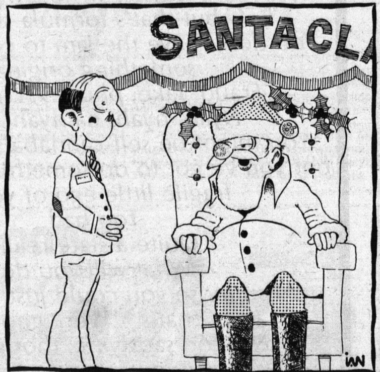
Look, I don't care if it is the festive season. I'm not letting those kids sit on my lap without this raincoat.