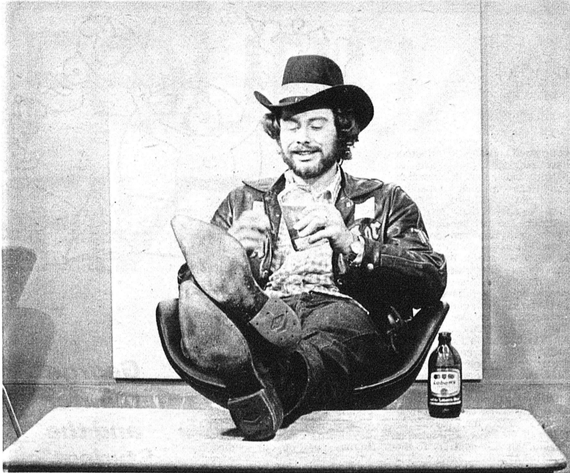
This man is in no shape to pose for a picture.