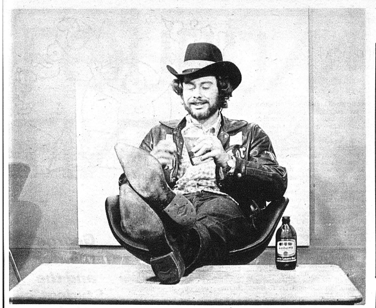
This man is in no shape to pose for a picture.