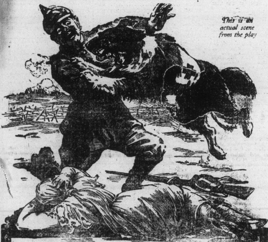
This is an actual scene from the play

Make Your Savings Serve You and Serve Your Country—Invest Them in War Savings Stamps.