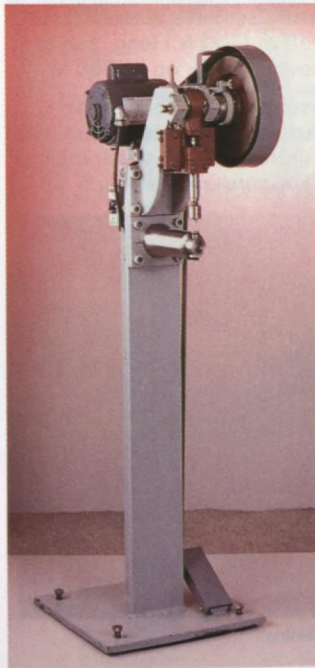
The TALOC fastening machine is ideal for fastening light-gauge sheet metal in the field.

The TALOC system is widely accepted for fastening elbows and fittings in the air-distribution industry. It works well with both unfinished and prefinished materials.