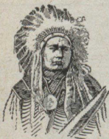
"First in the Northwest."

Do YOU know anything about "loadings"???