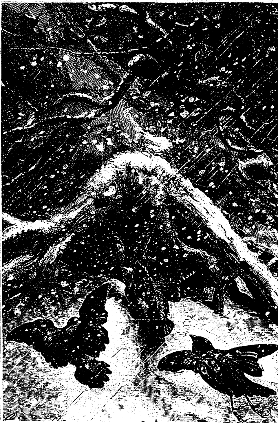
THE SNOW BIRDS.