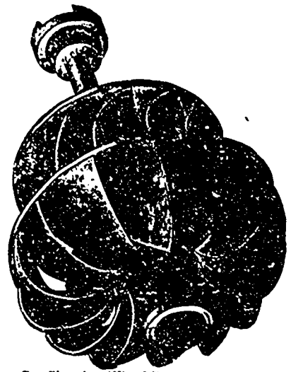
Cut Showing Wheel Removed from Case.

84 per cent. of power guaranteed in five pieces. Includes whole of case, either register or cylinder gate. Water put on full gate or shut completely off with half turn of hand wheel, and as easily governed as any engine.