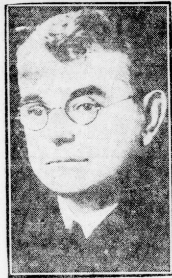
CHIEF JUSTICE CAVERLY,

"Whereas, it has been alleged in the public press of Canada that, if an inquiry were instituted, some interesting information and astonishing facts showing how the treasury of Canada