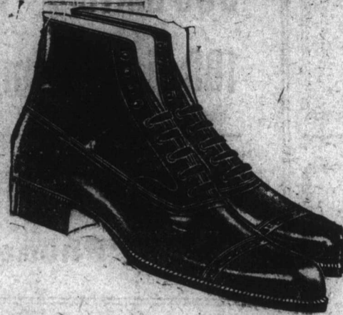
MEN'S CANADIAN ARMY BOOT—Good heavy solid leather boot, only $6.75. Same style for boys, sizes 1 to 5, only $4.00.