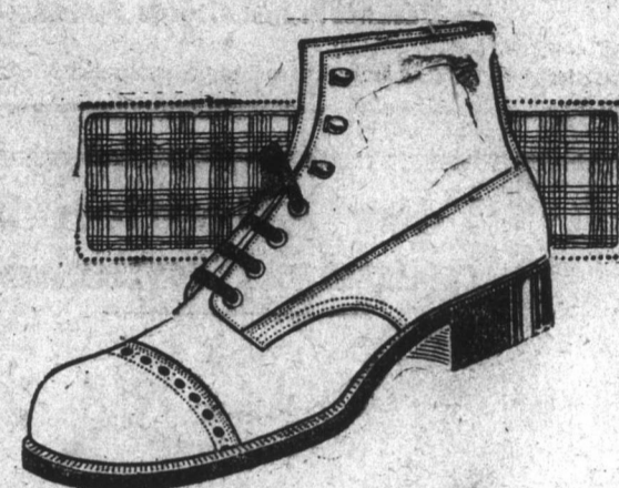
MEN'S TAN CALF BLUCHER, with rubber heels. The Young Man Boots, only $8.00.

We can fit correctly any of these styles of footwear with Rubbers.