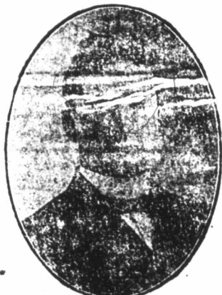
Professor C. C. Laugher Mus. Bac.

The point where oil has been struck is nine hundred miles from the nearest calling point of a river boat; 1,200 miles from the nearest railroad and 1,500 miles north of Edmonton the nearest city. The only means of access to the location at the present time is down the north rivers, which will only float boats of four or five foot draught and several rapids necessitate the unloading and transporting of cargoes overland and re-loading on barges. This precludes bringing oil up the river in any quantities until adequate transportation facilities are provided.