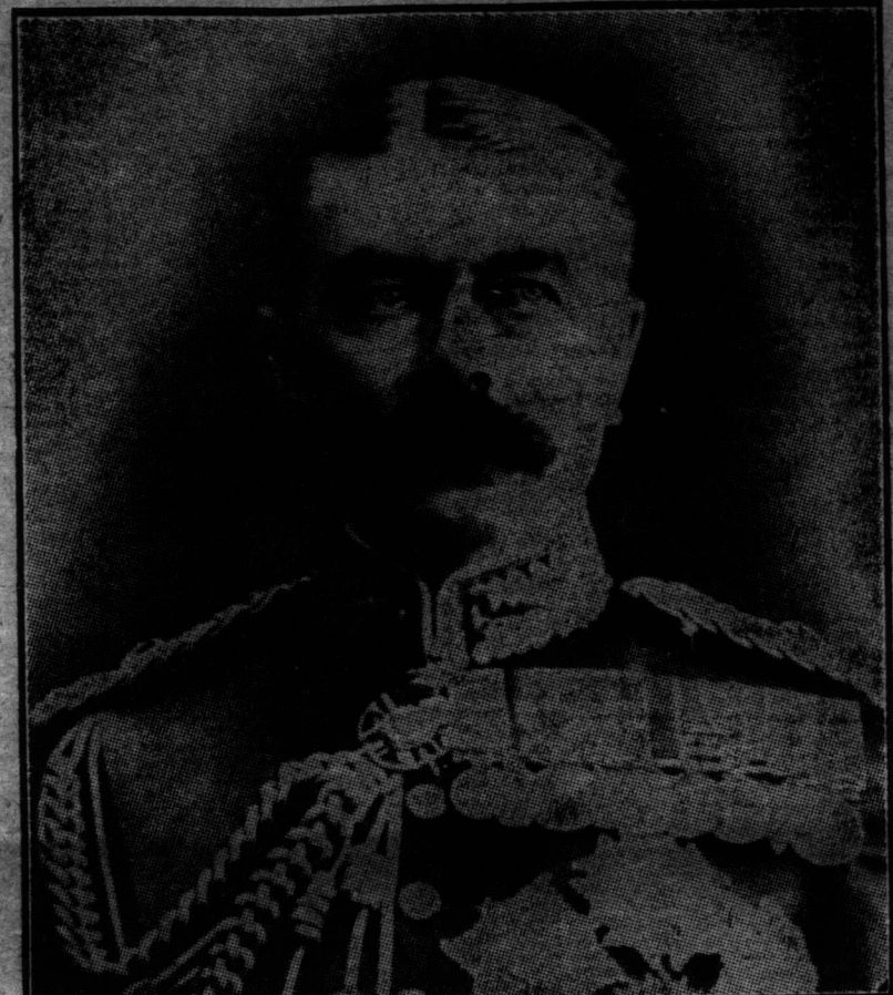
LORD KITCHENER Who is Making Things Hum in Great Britain's War Office just now.