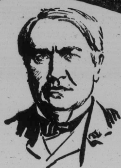
Thomas A. Edison