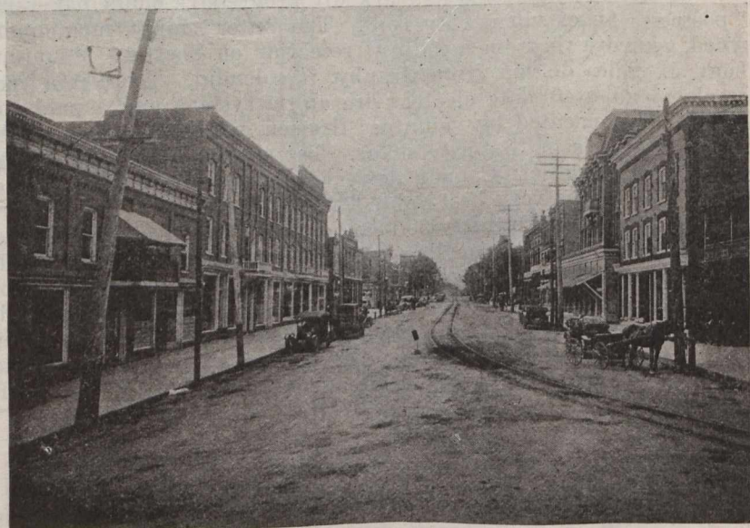
Main Street, Granby