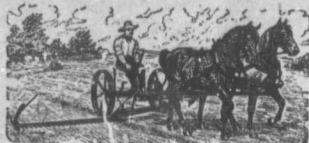
A Frost and Wood Mower starts to Cut the Moment the Horse Moves

The main sources of profit on this farm are the cows, of which from 10 to 15 are kept, and the milk sent to cheese factory. This factory is one of the good ones that run the entire year. Besides the milk, there is consider-