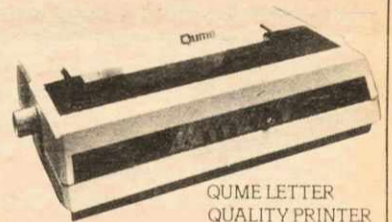
QUME LETTER QUALITY PRINTER