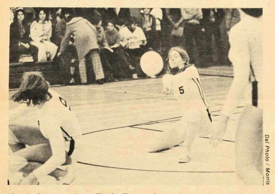
The Dal woman's volleyball squad entertains the Dartmouth Combines Sunday in preparation for the playoffs.