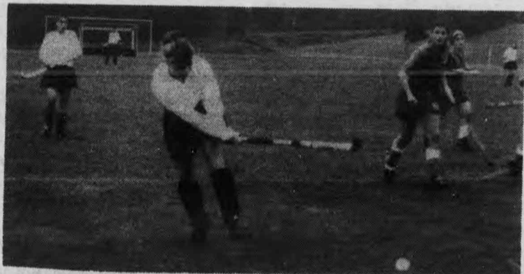
Go get 'em Red Sticks