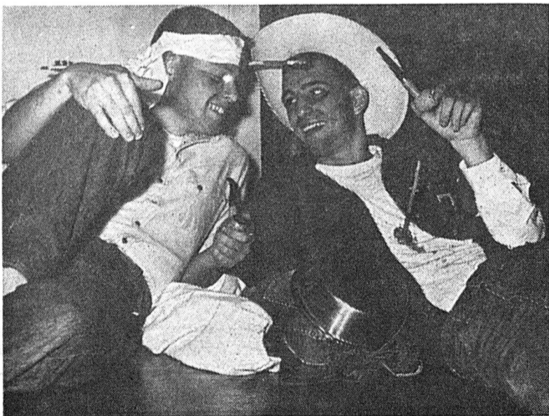
SUFFERING only minor injuries, these wounded warriors somehow managed to survive a recent residence coffee party.

The unit is to be completed by mid-February.