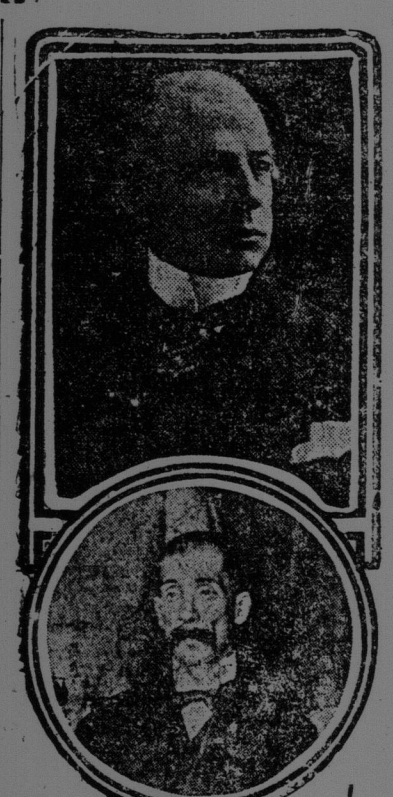
Baron Komura, the Japanese Ambassador in London.

Consul General Nossie claims to have received a cable from Tokyo from a source which he declines to disclose, and which gives an estimate of Japanese public opinion upon the Vancouver anti-Asiatic disturbances. The message is as follows: "The feeling, in spite of the character of the disturbances being very much greater than that of San Francisco, is throughout the empire most friendly to Canada. Whilst greatly regretting that this deplorable incident occurred, within a domain of the British Empire, whose ally Japan is, the tone of the press is very calm and the public shows no excitement, all depending upon the friendship, justice and fair play of the government and people of Canada, and also fully expecting that the best measures will be taken by the authorities for the protection of the lives and