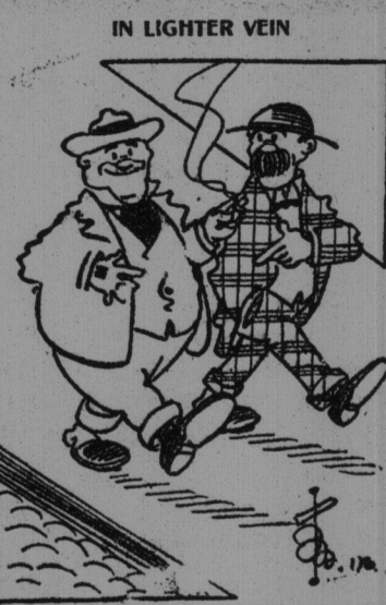
IN LIGHTER VEIN

The St. Croix Courier says: "After the storm of ballots in Tuesday's election in St. John, when the people decided in favor of the commission form of government, it should be more difficult than ever to find the 'hidden hand' which was so prominent a factor in the campaign."