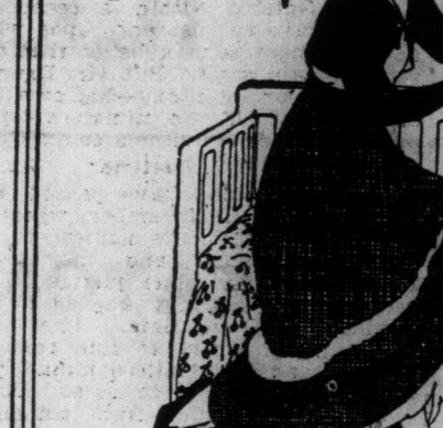
917 Dorion St., Montreal.

"I am writing to tell you that I owe my life to 'Fruit-a-tives' for this remedy relieved me when I had abandoned all hope of ever recovering my health."