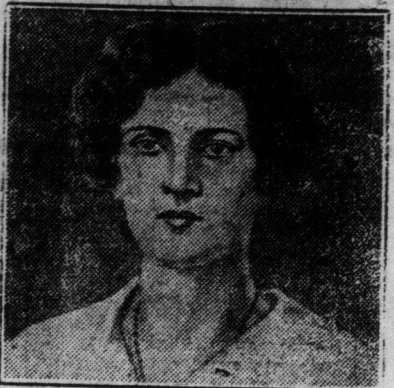
917 Dorion St., Montreal.

After Years of Suffering with Dyspepsia, this Fruit Medicine Gave Relief