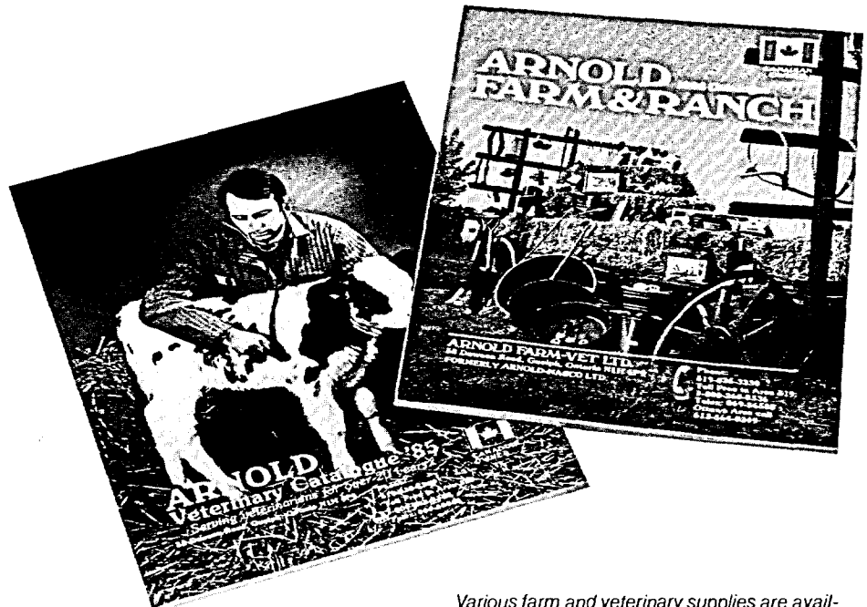
Various farm and veterinary supplies are available by mail order from Arnold Farm-Vet Ltd.