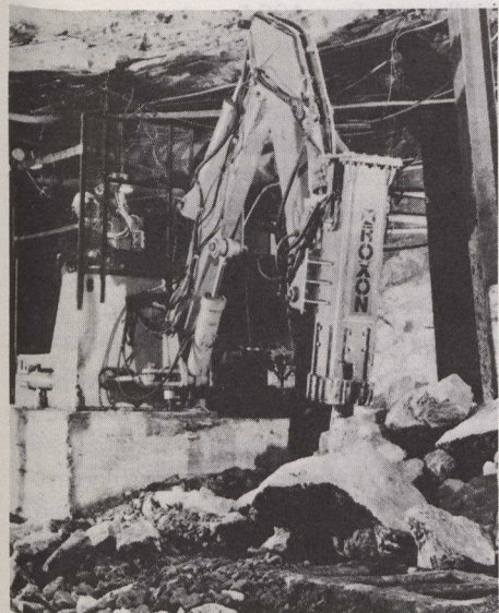
The TM16 hydraulic breaker boom, manufactured by Teledyne Canada, is used in underground operations.

Specialization is a major feature of the approximately 100 companies that form the Canadian mining machinery and equip-