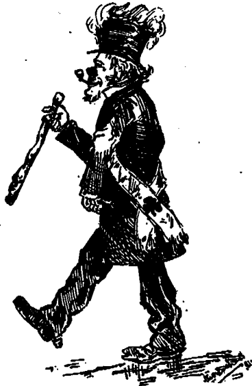
ST. PATRICK'S DAY IN THE MORNIN'.