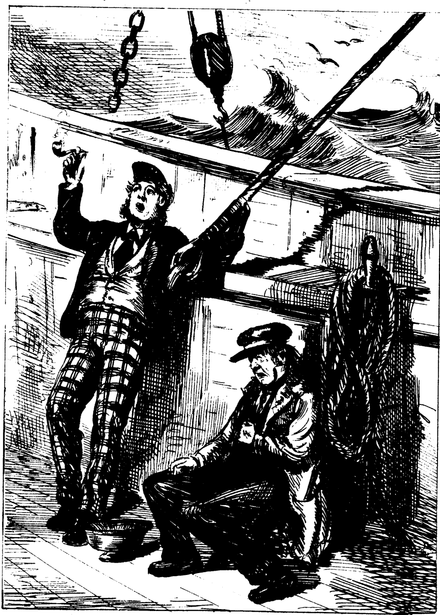
Scene on board an Atlantic Steamer. LITTLE BRITISHER, (singing).—"Rule Britannia, Britannia rules the waves." SICK GERMAN.—"Bridannia rule der wafes, toes she? Mine gott! I wish she rule tem straighter, mine gott!"