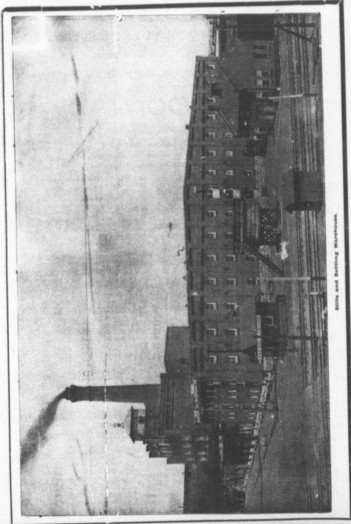
Still and Bottling Warehouse