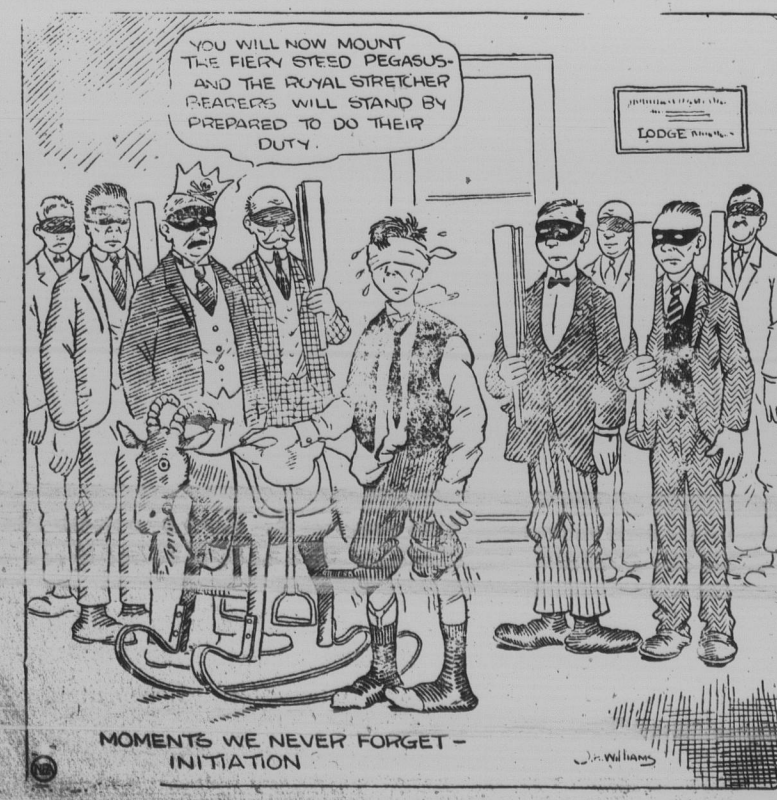
MOMENTS WE NEVER FORGET—INITIATION