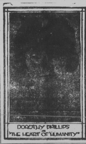
DOROTHY PHILLIPS "THE HEART OF HUMANITY"

"A tremendous picture." —Town Topics "One of the most stirring films ever presented in New York." —New York Evening World "Spectators thrilled to it with enthusiasm." —New York Herald "Takes rank with the great masterpieces of the screen." —Exhibitors' Trade Review "Our advice is, go see 'The Heart of Humanity.' —New York Tribune "Of the utmost intensity." —New York World