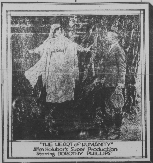
"THE HEART OF HUMANITY" Allen Holubar's Super Production Starring DOROTHY PHILLIPS

"A tremendous picture." —Town Topics "One of the most stirring films ever presented in New York." —New York Evening World "Spectators thrilled to it with enthusiasm." —New York Herald "Takes rank with the great masterpieces of the screen." —Exhibitors' Trade Review "Our advice is, go see 'The Heart of Humanity.' —New York Tribune "Of the utmost intensity." —New York World