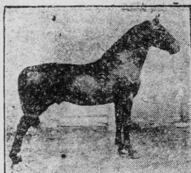
RILLINGTON STATESMAN, Registered No. 1717.

For the convenience of his patrons, Statesman now stands at his town stables, No. 9 Spencer Street. Tele- phone number 450.