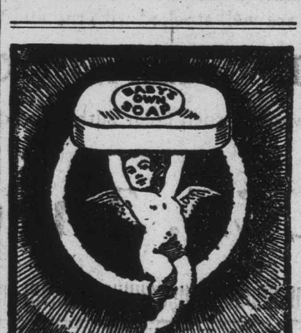
"Baby's Own" Soap

No where in the world perhaps are the fall exhibitions of so much educational value to the people who attend them as in Canada. The Canadian National Exhibition