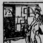
Farm-trunk supplier, etc., loaded easily through rear door.