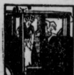
Plenty of room for everybody—the ideal family car.