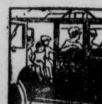
Big doors front and rear eliminate seat climbing.

Willis-Overland Sales Co., Limited HEAD OFFICE AND FACTORIES: TORONTO, CANADA Branches: Toronto Montreal Winnipeg Regina