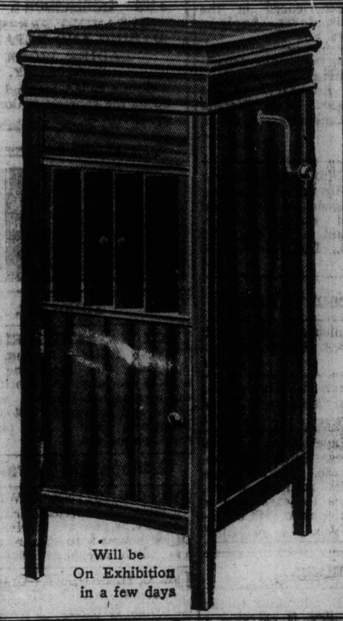
Will be On Exhibition in a few days

Explain to Your Friends To-day the Importance of Their Assistance During Booster Period.