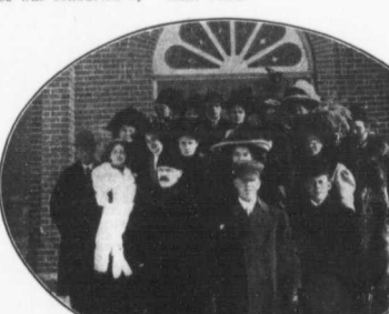
THE GREENWOOD CONTINGENT AT MYRTLE CONVENTION.

Course. A small fee was taken at the door, and the proceeds go to swell the Forward Moment Fund.