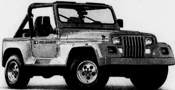
Jeep YJ The fun-to-drive convertible From $11,825***