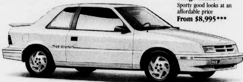
Plymouth Sundance/ Dodge Shadow Sporty good looks at an affordable price From $8,995***