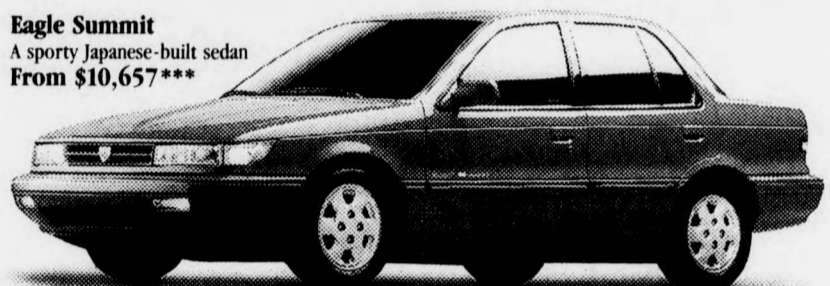
Eagle Summit A sporty Japanese-built sedan From $10,657***