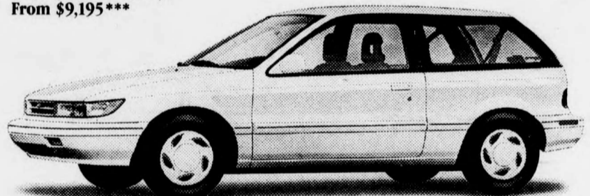
Plymouth Colt 200 A high-spirited car with style From $9,195***

You've worked hard for your education. And now Chrysler wants to start you on your way with incredible savings on your first new car or truck.