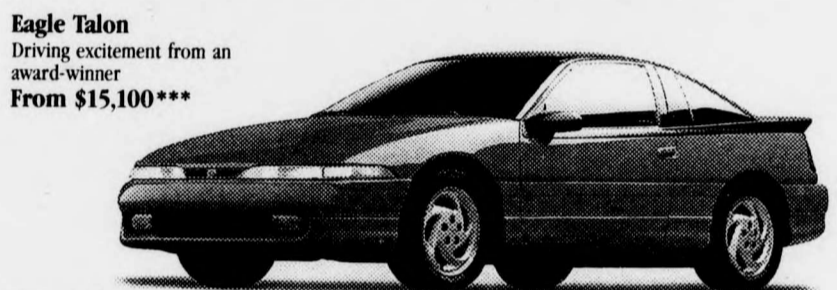
Eagle Talon Driving excitement from an award-winner From $15,100***