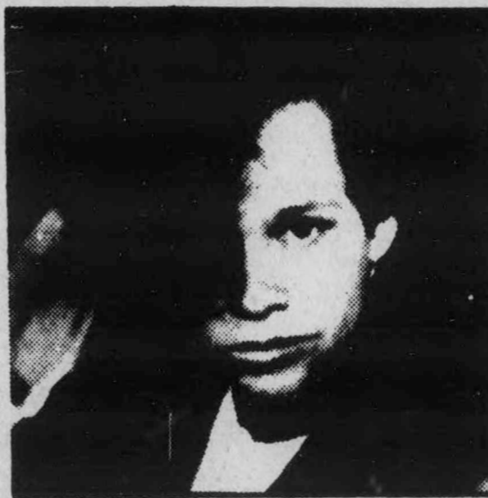
JOHN COUGAR MELLENCAMP COVER BAND