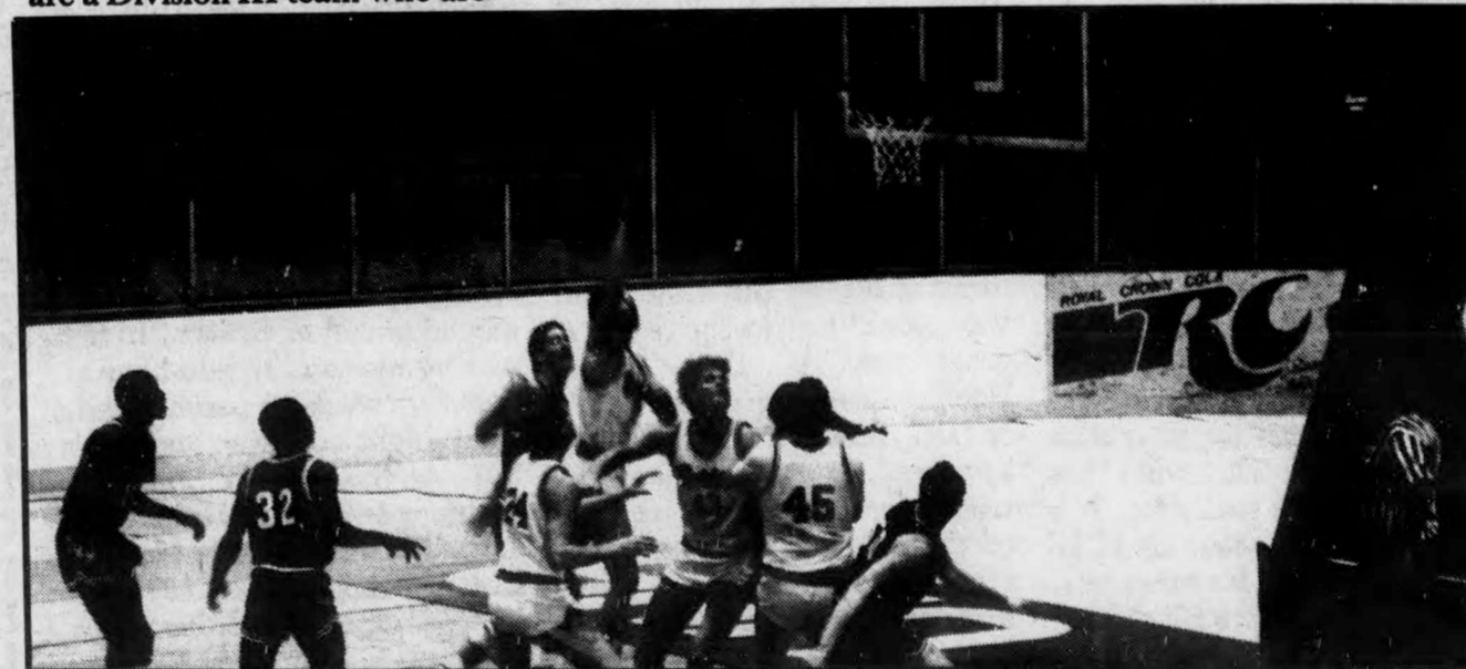
UNB in Saturday tournament.