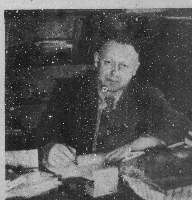
The Big Boss

The forestry course is in the middle of its transformation from a four year course to a five year course with the seniors and juniors in the four year course and the first and second year students in the five year course. So far this change seems to be king out satisfactorily and the students have ben ale to choose options that are within the time table possibilities. Every effort will be made to maintain as many options as possible as this is an underlying principle that must be maintained if the maximum advantage is to accrue under the five year course.