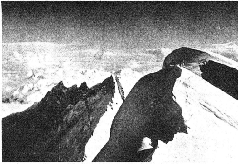
Everest; the summit.

At 29,028 feet, Nepal's Mount Everest is the highest mountain in the world and the most climbed of the Himalayan peaks. Since 1953, when Everest was first ascended by Hillary and Tenzing of the British expedition, teams from Switzerland, China, India, Italy and the United States have reached the highest point on earth. Many others have failed, not the least of which have been the six expeditions that attempted the difficult 10,000 feet southwest face of the mountain since 1969. In September, 1975, the first ascent of this face was made by Doug Scott and Dougal Haston, members of a nineteen-man British expedition led by Chris Bonington.